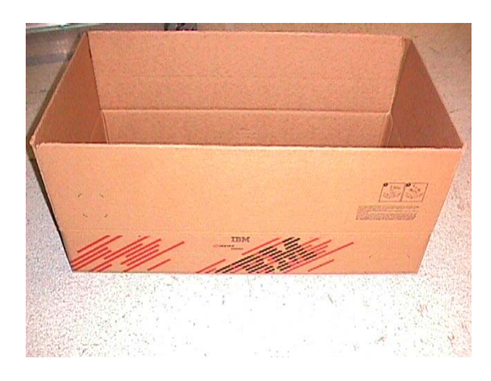
1.4 - Place bag 32R0130 onto the unit. Seal bag with 06P6550 tamper seal as shown below.