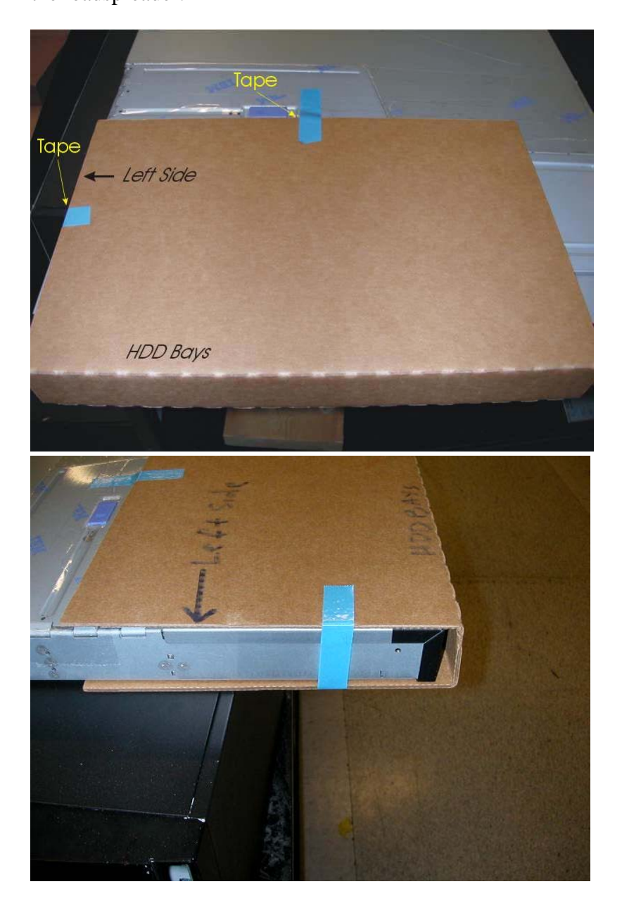
1.3 - Assemble carton 39Y7687 and tape the bottom flaps shut with IBM Logo Tape 74F5698 or 74F5699. Note: Old version artwork on carton is depicted.

1.2 Place loadspreader 39Y7468 onto front of system on the left side (over the HDD Bays). Tape the loadspreader onto the system with appliance tape 01R3747 (04N8185 is also acceptable). Wrap piece of tape goes around the left side of the system and loadspreader, and place one piece of tape at the top of the loadspreader.