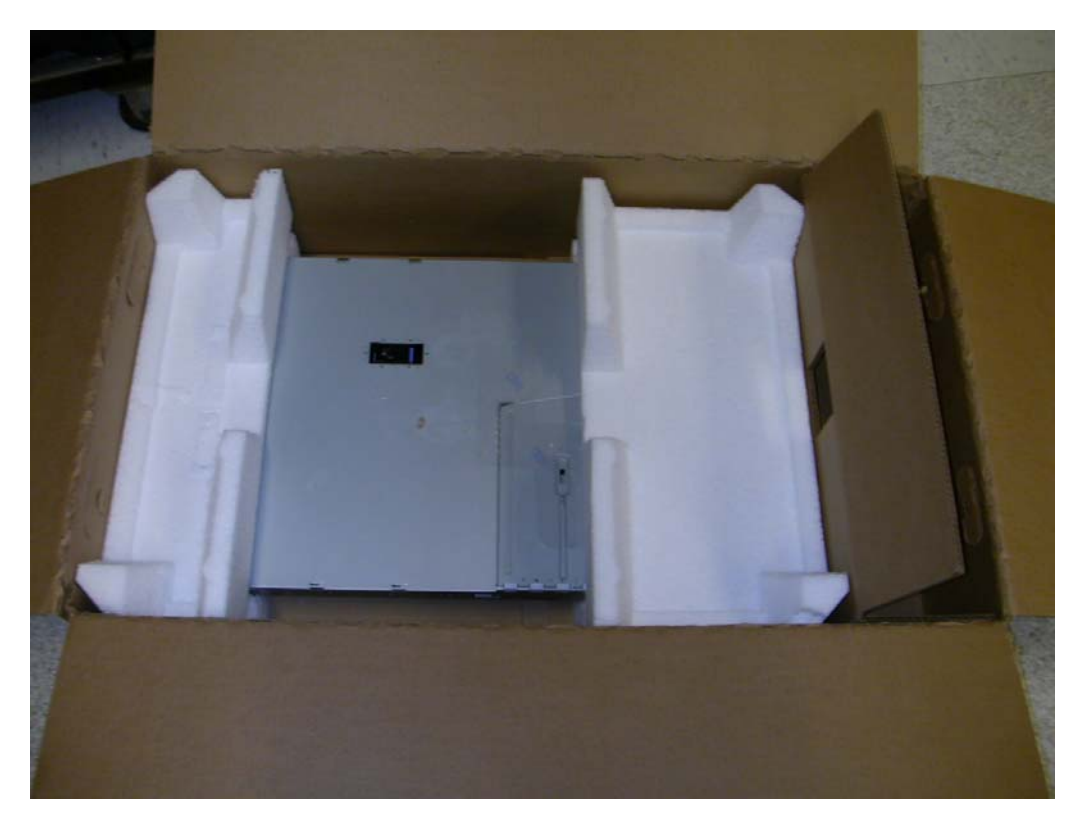
1.10 - Place rail kit on top of system as shown below. Note: Actual rail kit length may vary. Use hole in shipgroup for longer rail kits, if necessary.