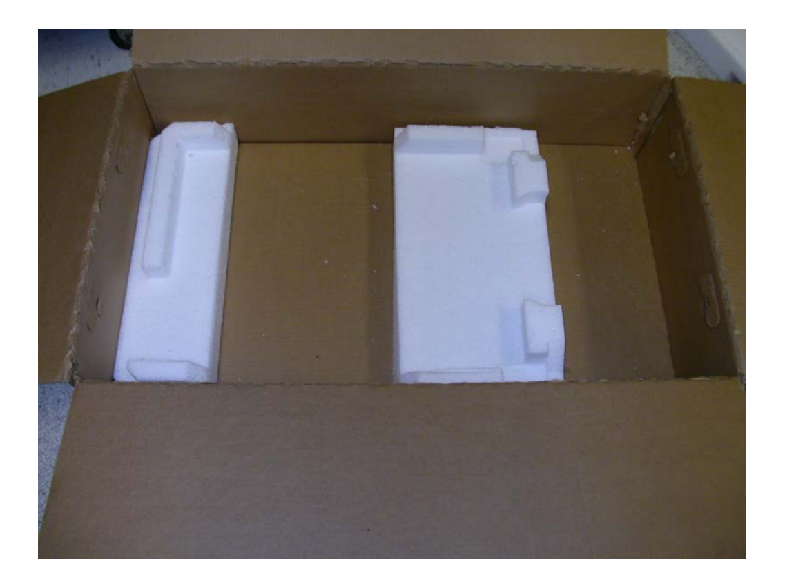
1.6 - Place the unit into cushions by placing unit into cushion with the front bezel going into cushions first.

Note: Bag is not depicted in the illustration for better visibility of product orientation.