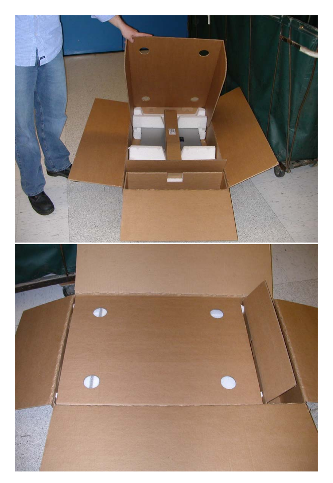
1.12 - Close flaps and seal carton as shown using IBM logo tape 74F5698 or 74F5699.