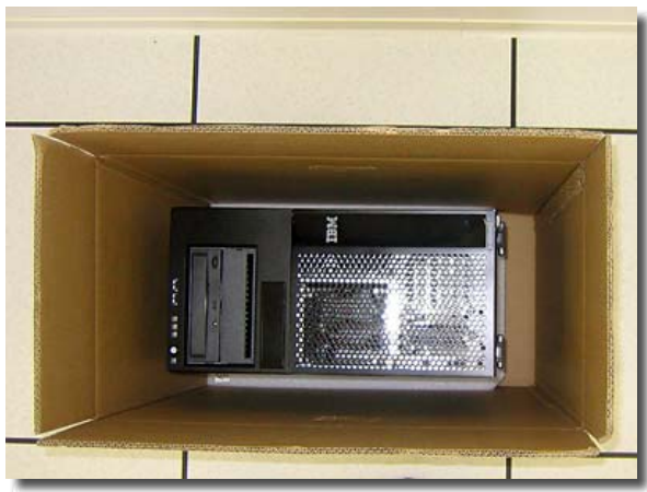
2.8 - Place paper documents into the space on one side of carton.