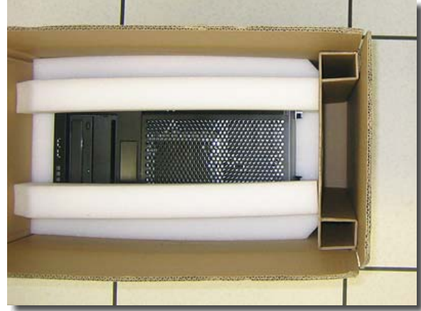
2.11 - Insert keyboard box into the compartment of filler. Skip this step if there's no keyboard bundled.