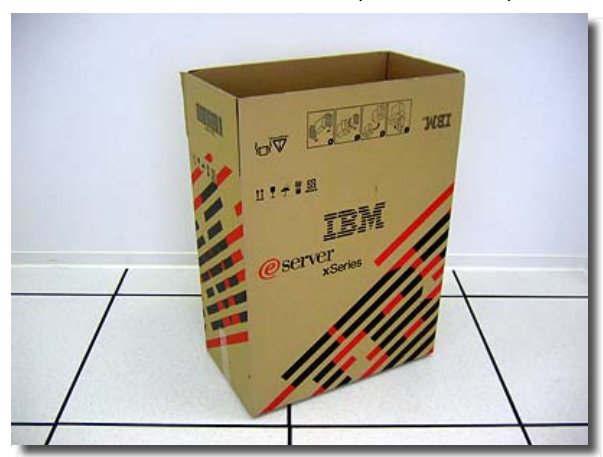
2.2 - Call machine to the packaging station. Verify the feet of unit are secure, verify unit is cosmetically clean and cover is correctly installed. Rotate machine and inspect all sides.

2.3 - Place bag 6165640 over the unit. (see illustration below).