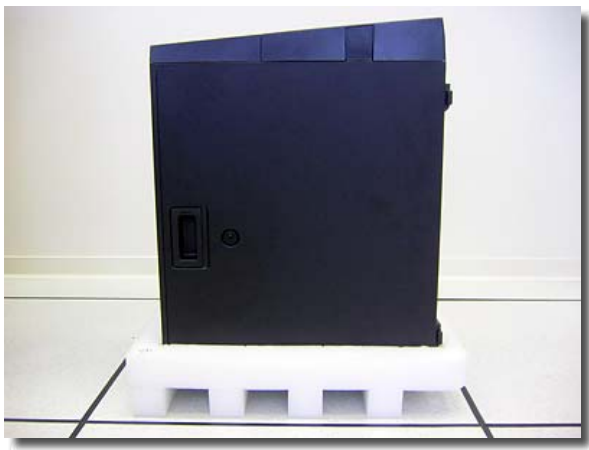
2.7 - Lift the cushioned system as shown and place it into bottom of carton.