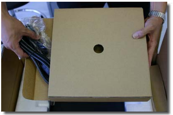
2.11 - Place shipgroup tray on top of unit as depicted below.