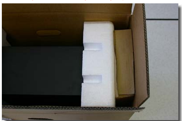
2.10 - Add accessories to shipgroup carton 25R7527.

Note: A keyboard or filler must be used and placed next to the rear of the system . If keyboard is placed in a different location, or if a filler box is not used, the system will be damaged during shipment .