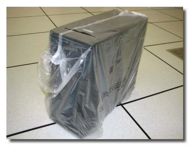
2.4 - Fold bag over, and seal bag closed with 06P6550 padlock label. (illustrated below).

Note: Bag part number can vary depending on geography, and availability . Refer to Packaging BOM for clarification .