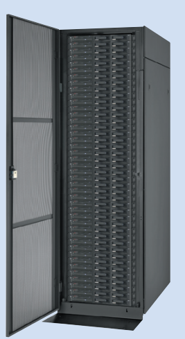
IBM NetBAY42™ Enterprise Rack

For complete rack solutions, turn to xSeries servers and options. Visit ibm.com /pc/us/eserver/xseries for more information on the best rack solutions in the industry.