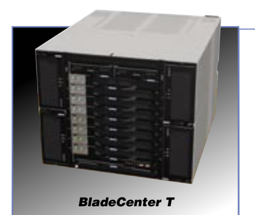
An attractive platform for next-generation networks The IBM @server<sup>™</sup> BladeCenter<sup>™</sup> T will enable an attractive

platform on which network equipment providers (NEPs) and service providers (SPs) can build their next-generation networks and meet the challenge of an on demand world. This highly scalable, rapidly deployable and high-density industry-standard computing platform will be designed to help speed revenue generation and lower overall SP costs.