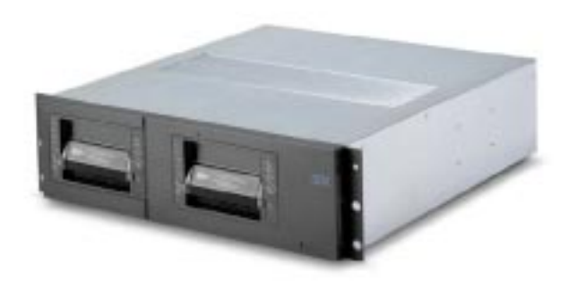
NetMEDIA Storage Expansion Unit EL with two DLT Tape Drives

Additionally, the flexible NetMEDIA Systems Management Adapter provides the added benefit of an Ultra-2 SCSI channel (also known as low voltage differential SCSI or LVDS) that handles both Ultra2 and earlier generation SCSI devices. Plus, the onboard electronic self-termination function lets you power off the NetMEDIA unit without disrupting the controlling server.