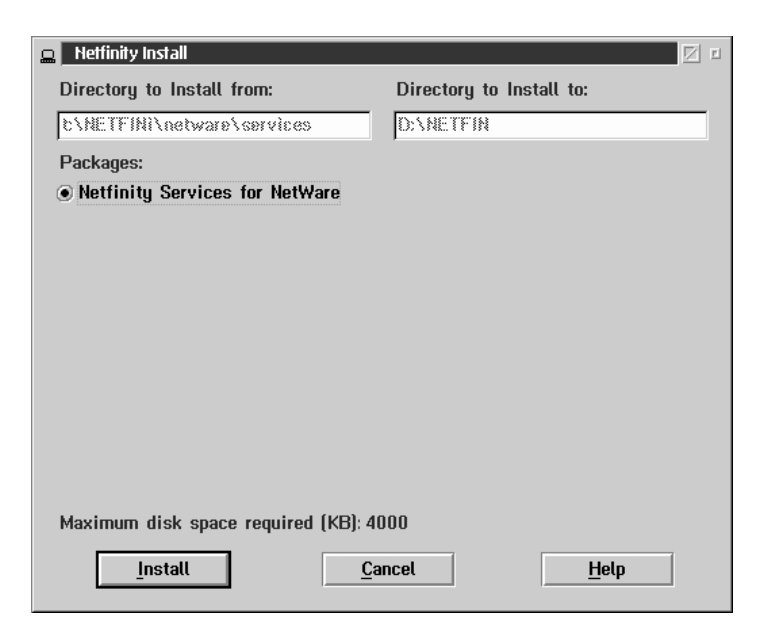
Figure 1. The Netfinity Installation Program

Enter the drive and directory name to which the Netfinity program files will be copied. The drive letter must be the drive letter you mapped on the server. The default is C:\NETFIN (on systems running OS/2) or C:\WNETFIN : (if the system is running Windows, Windows 95, or Windows NT).