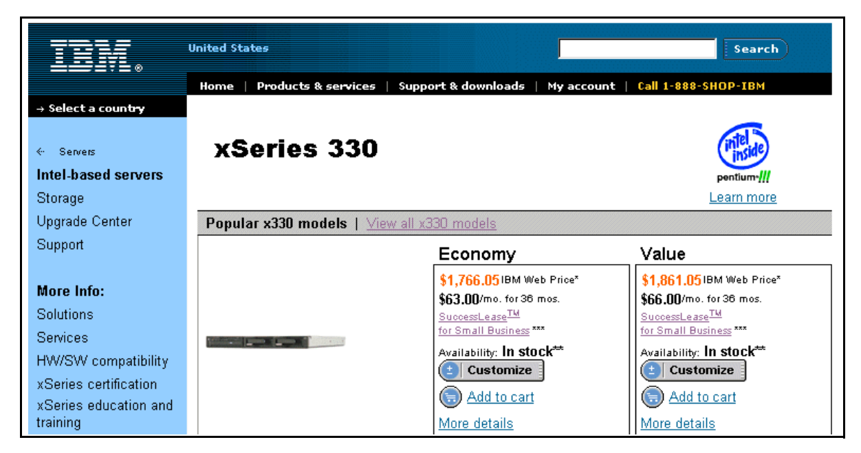
Figure 3. Note the various models

Click Customize under the model most likely to meet your needs.