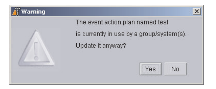
Figure 6. Prompt when modifying an existing event action plan

If you add or delete a filter or an action used in an existing event action plan, you will see the following prompt: