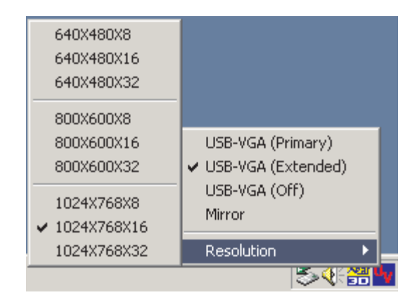
Figure 2. Display Utility menu icon

After the driver is installed, a utility will be installed in the lower right taskbar (next to clock). This utility allows you to quickly change the settings and resolution for your ACP50 Adapter. To access the menu, right-click on the icon shown in Figure 2.