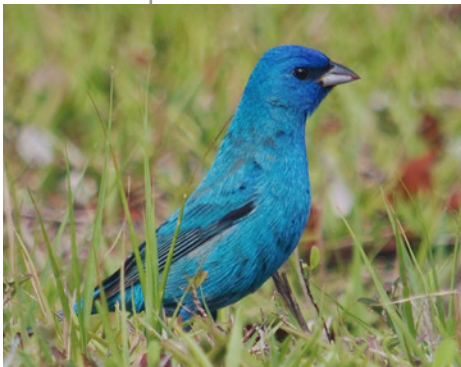
Indigo buntings nest and feed in young forest where shrubs, trees, and low plants grow thick.

For more young forest success stories, visit www.youngforest.org and click on “Habitat Projects” for your area. Many young forest demonstration areas are open to the public so visitors can see this important habitat firsthand.