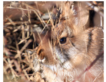
New England cottontail.

Many society members objected, mainly on aesthetic grounds. “After visiting habitat projects in neighboring towns where timber had been harvested,” Martin says, “we were horrified by what we saw: treetops, logs, and piles of brush strewn all over the place. Boyd Woods was a lovely, peaceful spot. We didn’t want that kind of a mess on our property.”