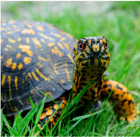
Box turtle.

To keep the land healthy and to have a diversity of wildlife, we need a balance of different habitats, including enough young forest. Landowners and land managers can make young forest to help wildlife from box turtles to black bears.