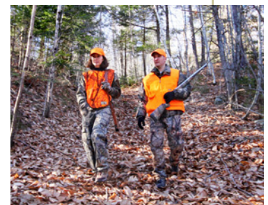
Hunters head for young forest in search of game.

Conservationists working together on the Young Forest Project don't want to pressure folks into doing things that go against the goals and priorities they've set for their wooded acres. But many landowners don't realize how important young forest is for wildlife, or the fact that they can actively work to create this vibrant habitat. Landowners who wish to see more and a greater variety of songbirds – or who care about