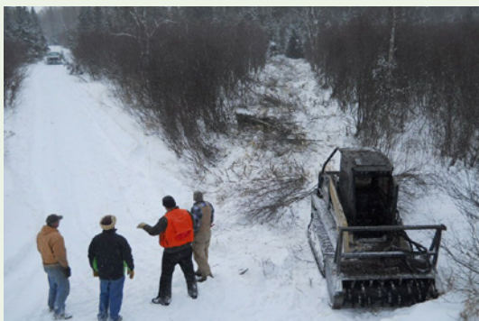
Alder shearing should be done in winter when the ground is frozen to avoid causing damage. Winter mowing also greatly improves sprouting the following year.

When shrubs get too old, they become spindly and sparse, and their habitat value to wildlife lessens. Low-impact machines with mulching or mowing heads can chew down older shrubs such as alder, dogwood, willow, or hawthorn, causing them to grow back more densely. Machines do this work quickly and efficiently, but it's also possible for individuals to cut back trees and shrubs using a chainsaw. Mowing or cutting stimulates the root systems of the shrubs to send up copious new shoots. Not only are those woody plants rejuvenated, but a whole suite of ground plants fills in the spaces between them, such as wild strawberry, milkweed, bergamot, clover, and plantain. Stands of dense shrubs provide great habitat for grouse, woodcock, songbirds, cottontail rabbits, moose, black racer snakes, wood turtles, and many other animals.