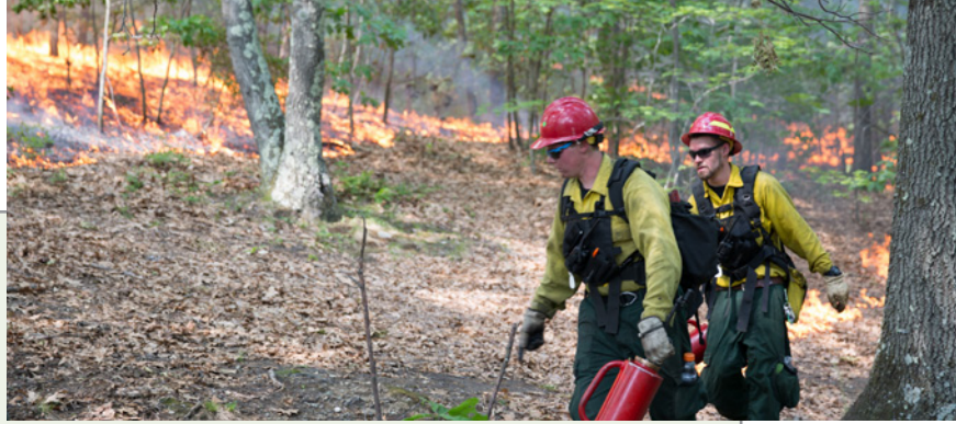
Controlled burning reduces flammable fuel on the ground and promotes a dense regrowth of trees, shrubs, and other plants.