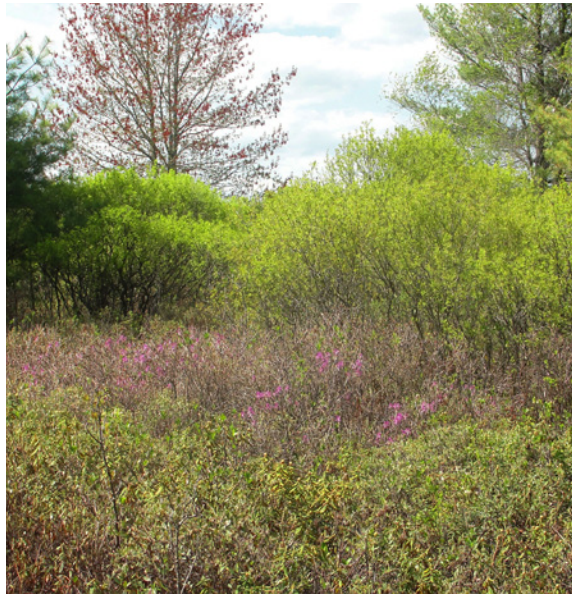
Photos from top, clockwise: Adirondack young forest, wild geraniums, springtime shrubs, whitetail deer, yellow warbler. Center, bobwhite quail