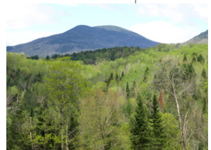
Most woodland in the East and Upper Midwest has become middle-aged. Creating more young forest helps many kinds of wildlife that need such habitat.

This shift to older woodland has caused the populations of many animals to steadily decline. State wildlife agencies in a 17-state region from Maine to Minnesota and south to Virginia and Ohio list more than 60 kinds of young forest wildlife as Species of Greatest Conservation Need. (Other wild animals that generally live in older woods, and whose