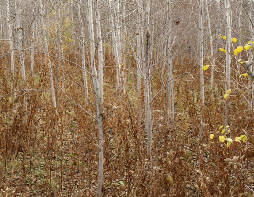
Young trees grow in an old field at Bellamy River Wildlife Management Area, a young forest demonstration area in southern New Hampshire.

Logging on steep slopes can lead to erosion. Cutting trees that cast shade on temporary woodland pools may cause those features to dry up too quickly, stranding young salamanders and frogs before they've had time to develop and leave the ponds as adults.