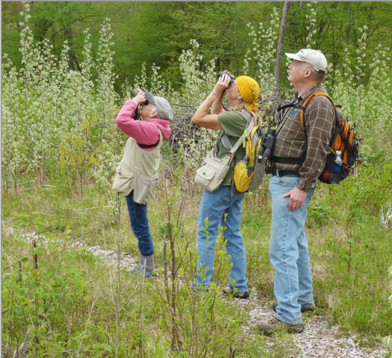
Nature observers find many different kinds of birds in young forest habitat.