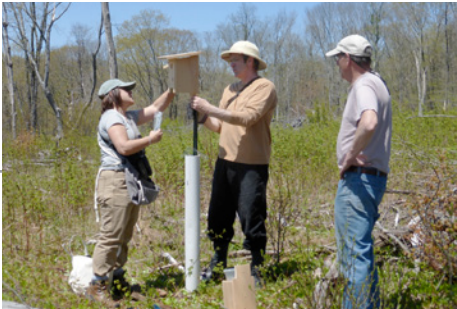
Putting up bluebird boxes on a spring day at Boyd Woods Sanctuary in Connecticut.

Many people go birding, hiking, cross-country skiing, or hunting in young forest settings. They get great satisfaction from seeing diverse wildlife and knowing that their habitat management efforts are helping to bring back wildlife whose populations have been falling.