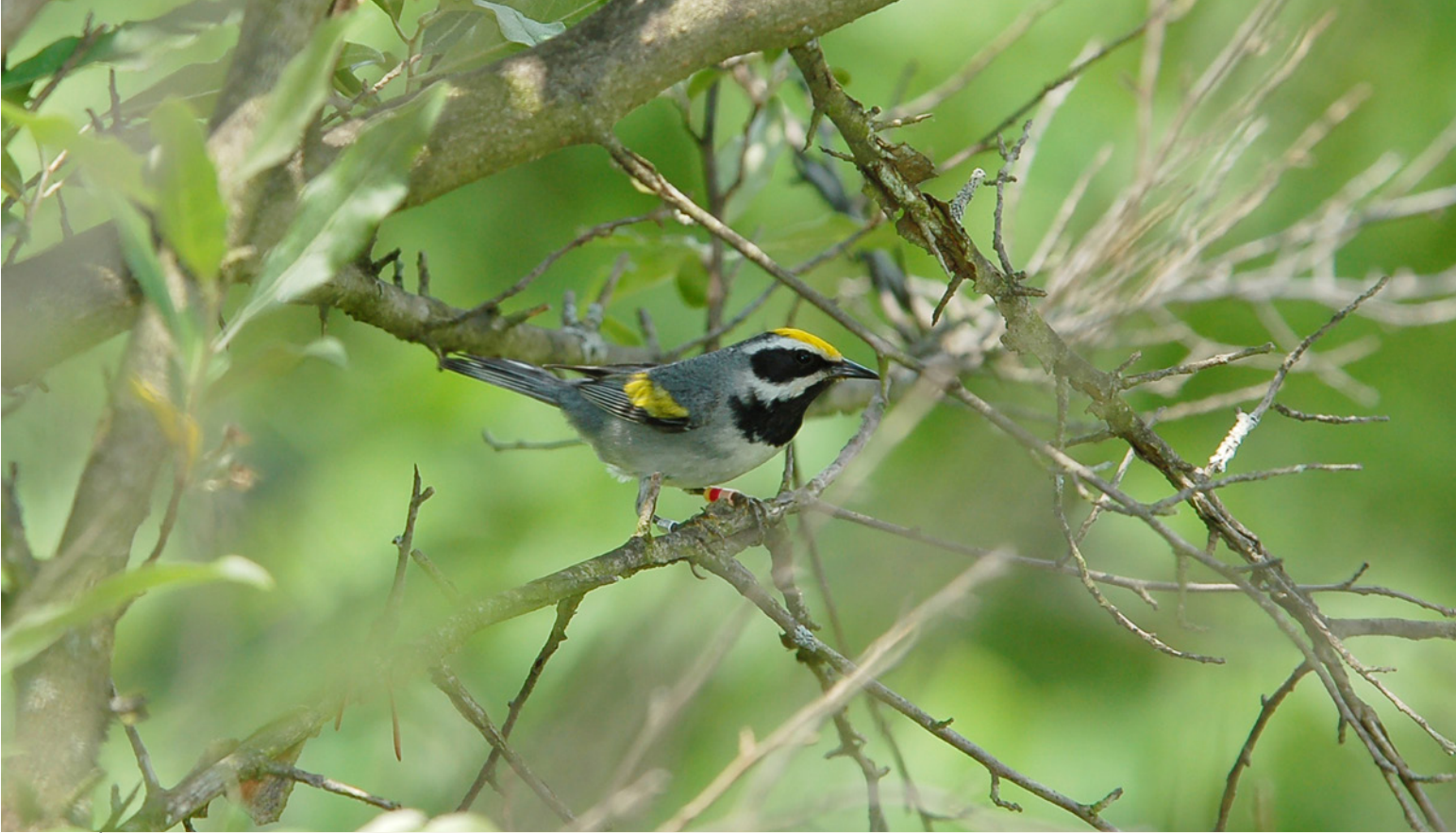
Golden-winged warblers use brushy habitat with a few large trees to provide feeding opportunities and singing perches.