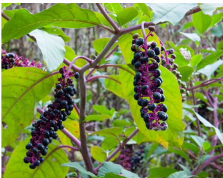
Pokeberry.

To learn what young forest looks and “feels” like, visit a habitat demonstration area near you.