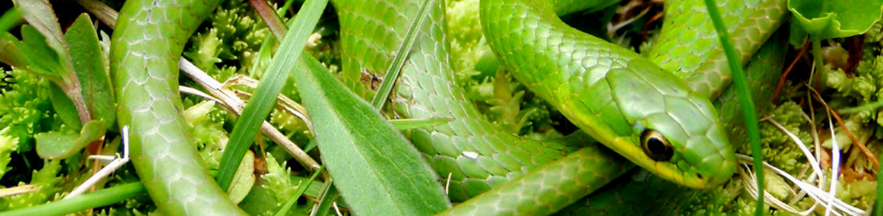
Smooth green snake is a Species of Greatest Conservation Need in many states.