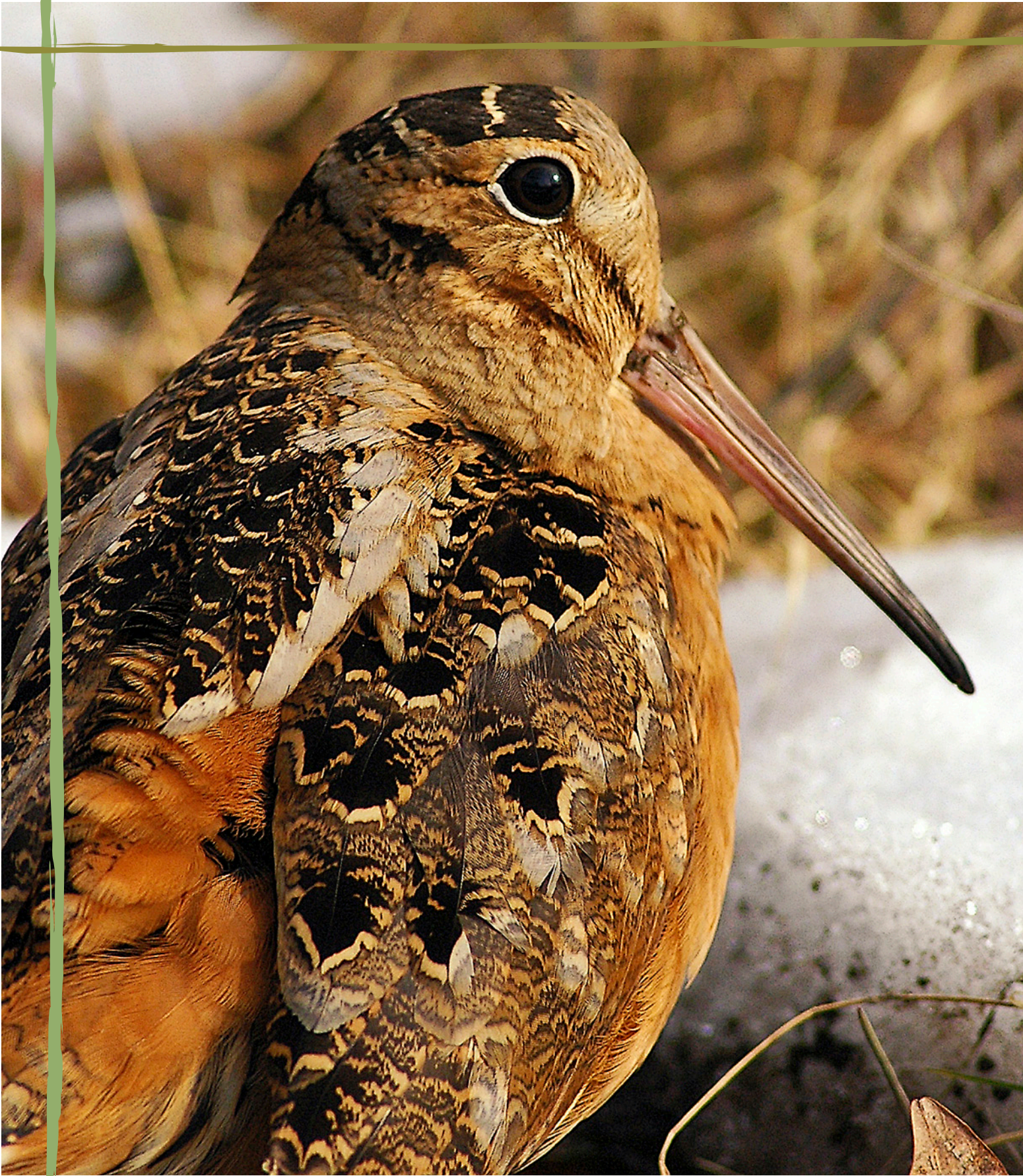
American woodcock. Partners in the American Woodcock Conservation Plan have begun to halt this bird's rangewide population decline by making young forest habitat over the last decade: see www.timberdoodle.org.