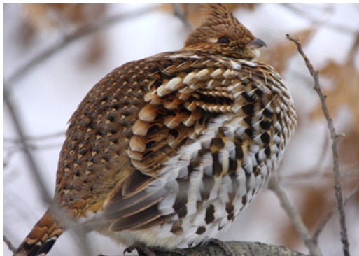
Ruffed grouse.

Young forest grows quickly. On sites with good moisture and soils, vegetation will come back strongly in one year. On sites with poor soils, it may take a few years to get abundant regrowth.