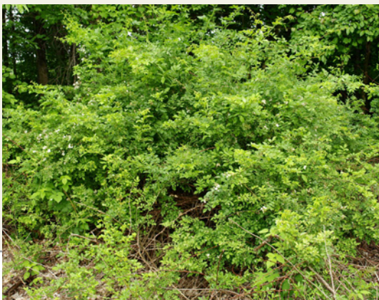
Multiflora rose.

In some areas, stands of forest and shrubland may include exotic invasive shrubs (often simply called “invasives”) such as autumn olive, multiflora rose, Japanese barberry, Asiatic bittersweet, bush honeysuckle, and buckthorn. These aggressive intruders often spread at the expense of native plants that offer longer-lasting and more-nutritious food for wildlife. Contact habitat experts and plan carefully before taking actions – such as mowing older shrubs or harvesting trees – to prevent invasives from spreading. Spot-treating non-native plants with herbicides both before and after a timber harvest can give native trees and shrubs an edge. It may make sense to gradually remove invasives over a period of years while replacing them with native shrubs.