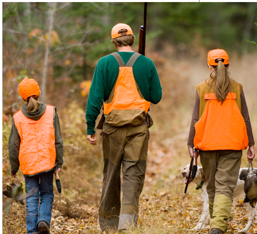
Bird hunters seek out young, regrowing forest to find ruffed grouse and woodcock.