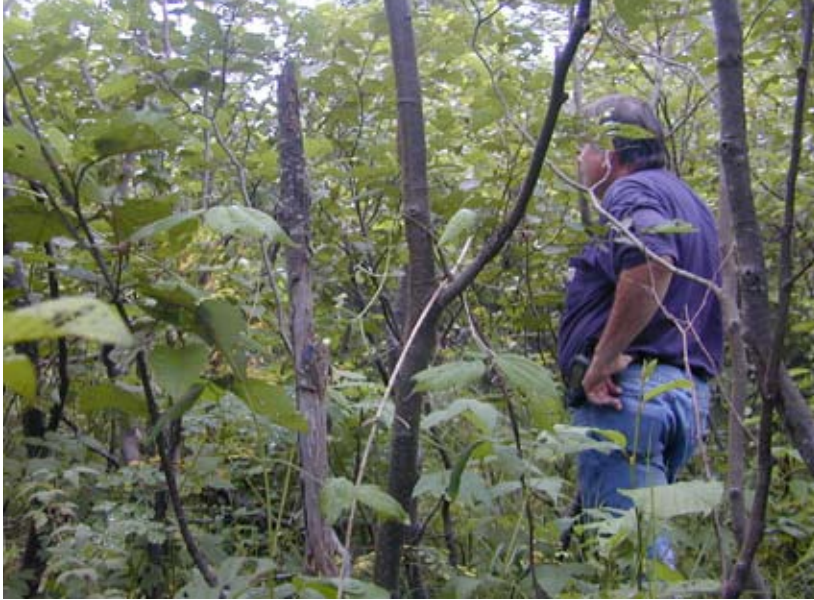
Alder provides important feeding cover, especially during drought.