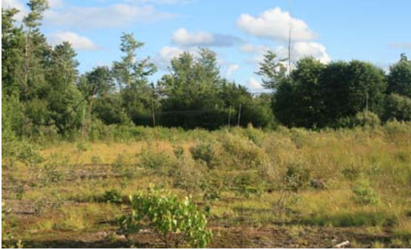
If large enough, log landings can serve as roosting fields.