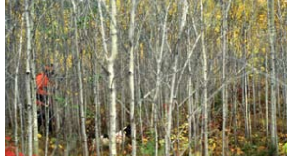
Aspen stands respond vigorously to cutting.