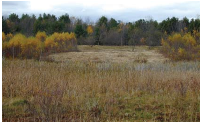
Woodcock fly to open fields or new clearcuts at dusk from late July until migration. Roosting fields provide protection from predators.