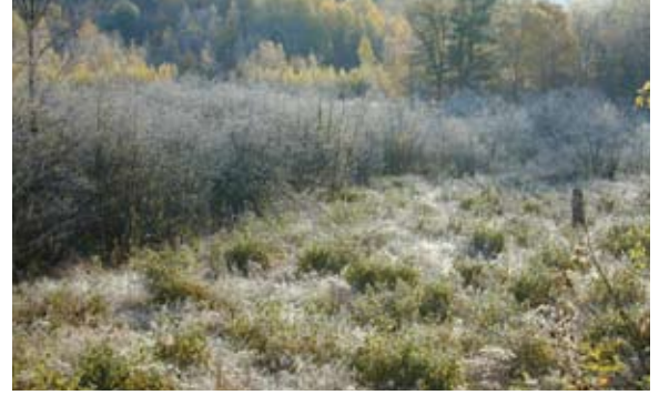
Riparian areas provide a consistent source of earthworms.

Dense young-forest habitats should be created and maintained in riparian management zones (RMZs) along rivers and other watercourses, provided the management can be conducted without harming water quality.