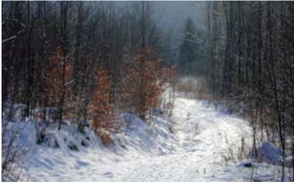
Woods roads adjacent to young forest can be used as singing grounds./Scot J. Williamson