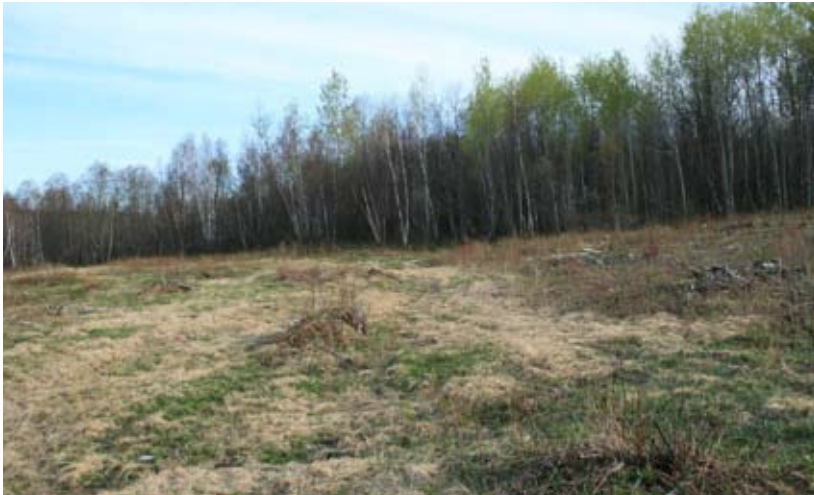
Log landings can serve as both singing grounds and roosting fields if properly sized and managed.

Many landscapes in the Upper Great Lakes region have areas suitable for woodcock singing grounds, such as log landings, bogs and peatlands, pastures, managed openings, and old fields with pioneering aspen, hazel, or other shrub species.