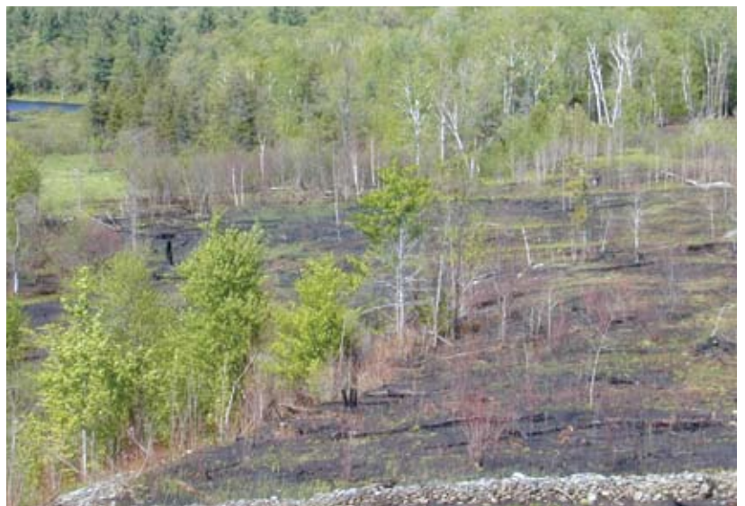
Annual burning of roosting fields increases their use by woodcock.

Controlled burning can be a cost-effective tool for maintaining tracts in early successional forest stages. Fire has influenced plant and wildlife communities in the Upper Great Lakes for centuries. Many of the species targeted by this Initiative evolved in the presence of periodic fires. Along with being a great natural tool to manage and maintain habitats, prescribed fire has the