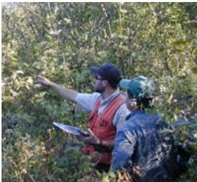
Assistance from a professional wildlife biologist is the first step in managing land for woodcock.