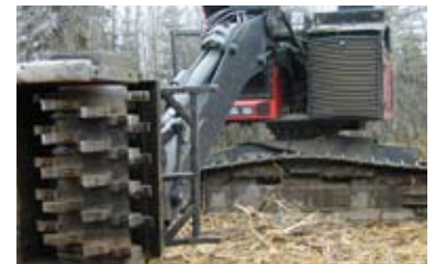
In some situations, mechanical cutting of alder can be an efficient and economical practice. A brontosaurus has a specially adapted cutting head.