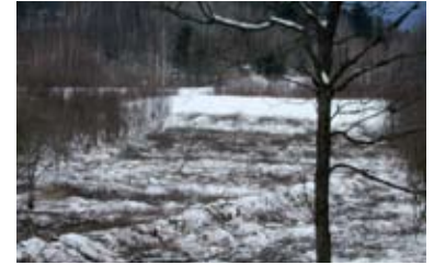
Strip cutting in alder is the preferred method of regeneration to regain the stem density preferred by woodcock./Scot J. Williamson