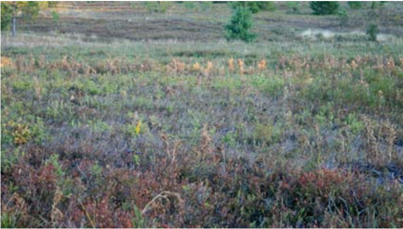
Woodcock can roost in blueberry barrens.

Nesting and Brood-Rearing Habitats are often brushy and dense, or they may have some small pole-sized trees rising above a dense shrub layer. In general, nesting cover is somewhat drier than typical daytime feeding areas, but the two are often one and the same.