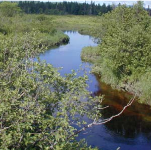
Woodcock need diverse habitats.

W oodcock need forested habitats – specifically, young or “early successional” forests. As forests mature, their value to woodcock declines. In the Upper Great Lakes region, most regenerating forested habitats are suitable for woodcock only during the first 20 years following cutting. Therefore, in landscapes to be managed for woodcock, young forests must be continually regenerated to keep them producing woodcock. Woodcock require several distinct habitat components within their territories: feeding areas, roosting fields, singing grounds, and nesting and brood-rearing habitat.