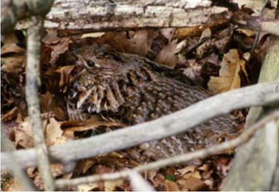
Ruffed grouse nest on the ground.