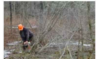
Alder strips may be regenerated by manual cutting.