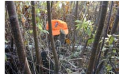
Alder sprouts from cut stumps.