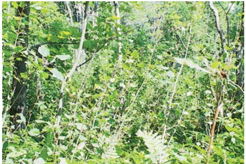
Woodcock feed among young, densely regrowing trees.

Feeding Areas have rich, moist soils that support abundant soft-bodied invertebrates, especially earthworms, a favorite food of woodcock. These areas are stocked with young regrowing trees whose high woody stem densities protect the birds from predators.