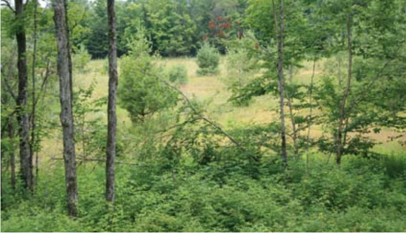
Forest openings are frequently used as woodcock singing grounds.

2. Eight singing grounds per 100 acres. Singing grounds should be at least 0.5 acres in size. (Refer to the Singing Ground section for more details.)