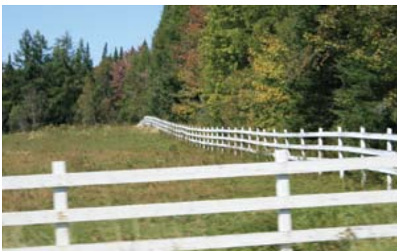
Woodcock use grazed pastures as singing grounds.

Male woodcock may use areas as small as a quarter acre if the surrounding habitat is not dominated by trees over 25 feet tall – for example, barren areas in shrub-dominated wetlands. Trails through forested areas, with wide spots (two to three times as wide as the trail by about 50 feet long) spaced 200 to 300 feet apart, can also function as singing grounds.