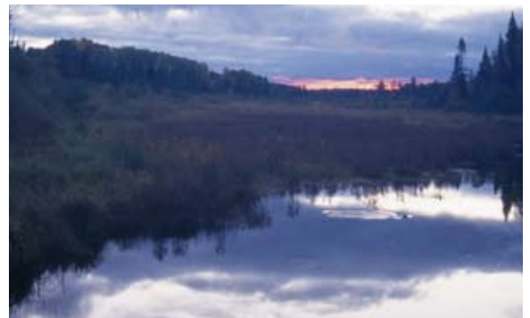
Beaver pond in Minnesota.

Aspen, like alder, frequently grows with “wet feet”: logging aspen on frozen ground will protect non-open-water wetlands and floodplain forests. Leaving filter strips of vegetation will minimize erosion and help protect water quality.