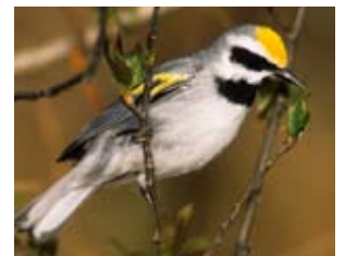
Many songbirds, including the golden-winged warbler, are more abundant in younger, brushy forest than in older woods.

Providing a mix of different-aged habitat conditions will benefit not only woodcock but a whole suite of wildlife species. Remember, each management practice will not benefit all species equally, and some practices may produce conflicting outcomes: what helps one species may harm another, even among species associated with young forests. Each property owner will need to decide which species are the highest priority on their land and which management practices will be most beneficial.