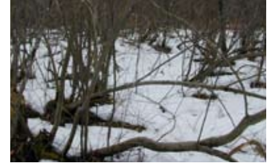
When mature alder begins to grow horizontal, the stand has outlived its maximum benefit to woodcock.

• Alder harvest techniques should be implemented with minimal disturbance to the shrubs' root systems. Do not pull the whole alder plant out of the ground.