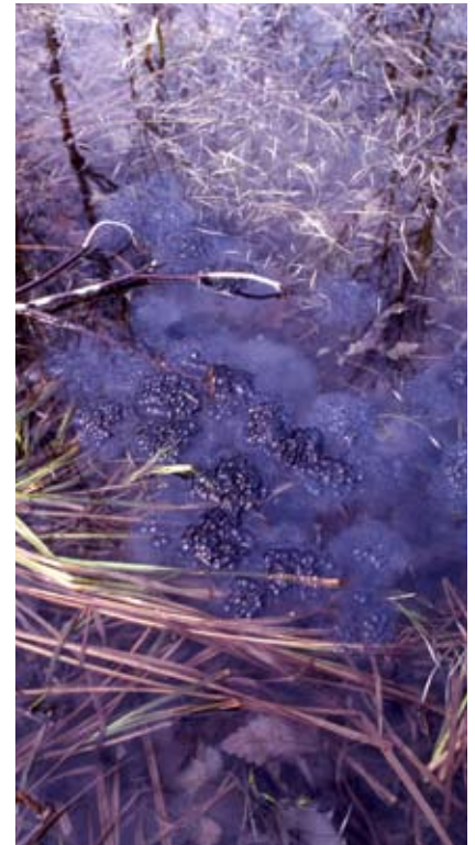
Vernal pool/Charles Fergus