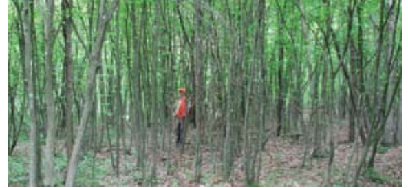
Small pole-sized stands with dense understory may be used for nesting.

The American woodcock is not the only species that requires these kinds of habitat. Many birds found throughout the Upper Great