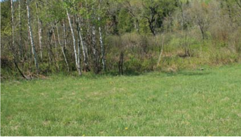
Woodcock singing ground./Scot J. Williamson

Singing Grounds (courtship areas) and roosting fields are relatively open habitat components with sparse cover, lying close to feeding and nesting areas.