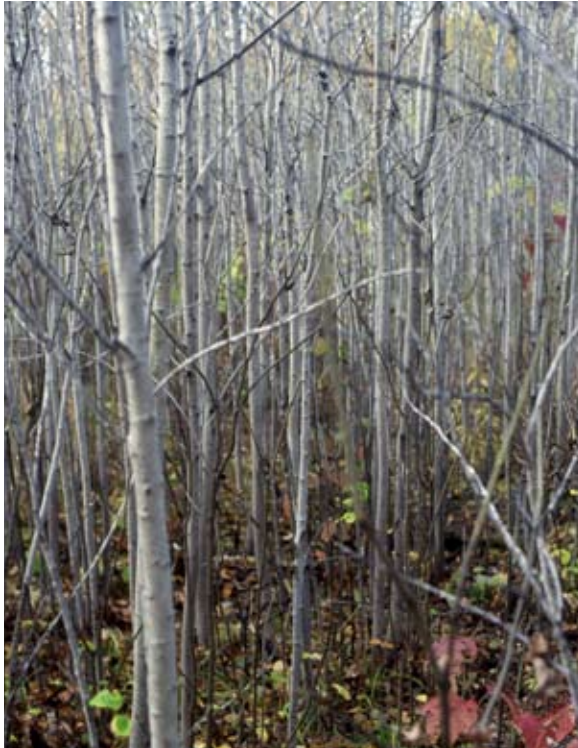
Aspen patch./Charles Fergus