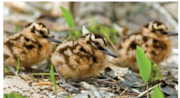
Woodcock chicks.

vegetation to yield dense sapling growth. Because soils in these areas are most likely to stay moist even during drought conditions, the core wetland or other moist-soil areas in the management unit will be the most reliable habitats to support woodcock populations through time. Create other feeding areas in adjacent upland habitats using even-aged forest cuttings of \geq 5 acres. These cuts will stimulate the sprouting of shade-intolerant tree species such as aspen. In preferred forest types managed for commercial timber harvest (see Feeding Areas section), manage for a mosaic of feeding areas so that 25 percent of the unit is in each of the following four age classes: 0-10, 11-20, 21-30, and 31-40 years post-harvest.