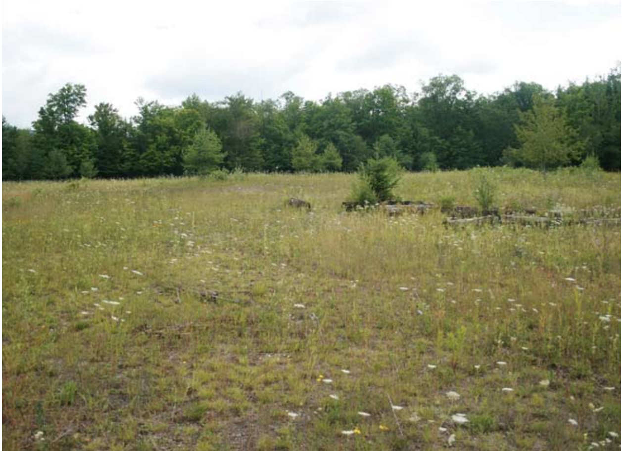
As weeds and brush begin to grow on abandoned gravel pits, woodcock may use these sites for roosting.

timber management. Generally accepted guidelines for creating roosting fields are: