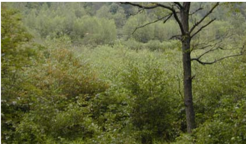
Five years after strip cutting, alder stem density is again high enough to provide excellent feeding cover.