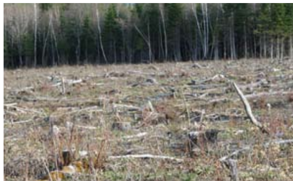
Woodcock roost in areas with sparse vegetation, such as this recent clearcut.