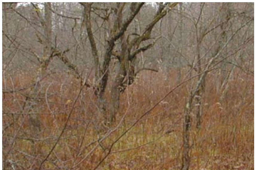
Abandoned farmland provides good feeding habitat for woodcock.