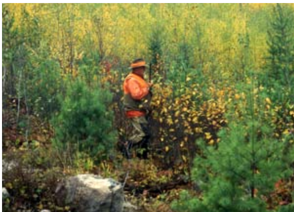
Aspen regrows densely.

season. Whenever possible, operate on frozen ground to minimize disturbance to moist soils and wetlands.