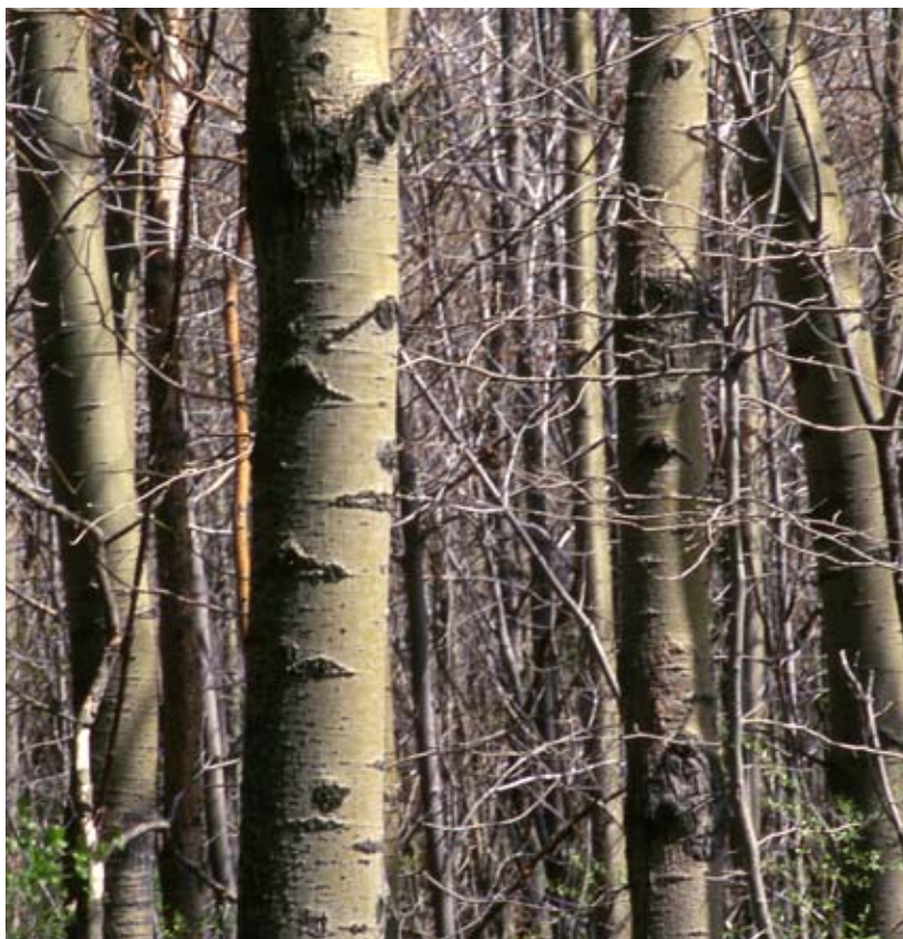
The aspen in this stand are approaching maturity.

Aspen responds to cutting by sending up a dense network of saplings that sprout from underground roots; this dense stem growth makes aspen an excellent sylvan species to manage for woodcock. Even if aspen is scarce in a forest stand, it can become dominant if managed correctly: stands with as little as 30 square feet of basal area of aspen per acre can be suitable for aspen management.