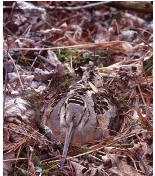
Avoid conducting management activities when woodcock and other wildlife are breeding.

As forested habitats mature, their value to woodcock will decrease. In the Upper Great Lakes region, most woodcock use of regenerating forested habitats is limited to approximately the first 20 years following cutting. In landscapes managed for woodcock and other birds that use early successional habitats, young-forest habitats need to be regenerated periodically as they age. Try to provide a mix of different-aged habitats on the landscape by using a variety of management tools that introduce disturbance into forested areas, such as commercial timber harvesting, noncommercial shearing, mowing, controlled burning, and herbicide application.