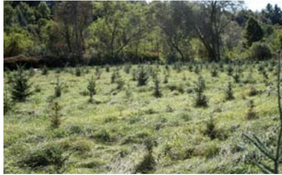
Newly established forest plantations can serve as woodcock roosting fields in heavily forested landscapes.

In heavily forested areas without frequent active management, or where management is not even-aged, roosting fields should be created and maintained as part of normal